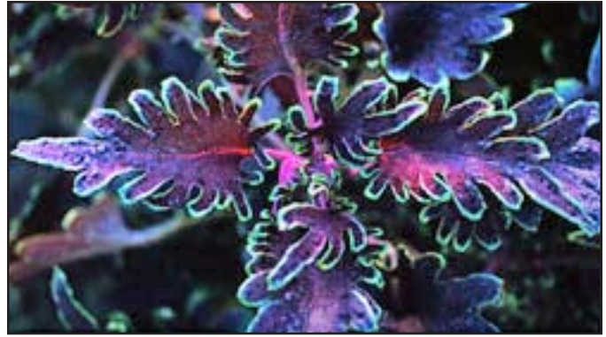
Kiwi Fern Coleus

Coleus 'Kingswood Torch' 'Kiwi Fern' 'Red Head' 'Tilt a Whirl' 'Trusty Rusty' – We keep on adding exciting new coleus. But the leaf color and shapes are irresistible.