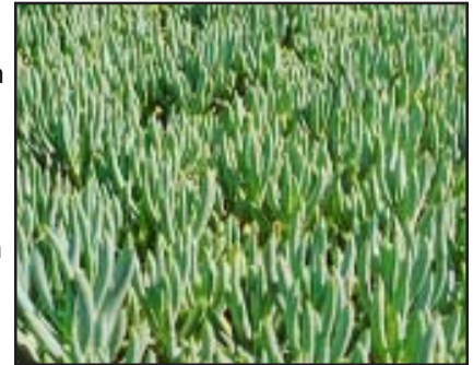
Senecio 'Blue Chalk Sticks'

Geranium 'Calliope Dk Red' – Revolutionary breakthrough in geranium breeding. Low branching and horizontal branching, makes this geranium excellent in hanging baskets.