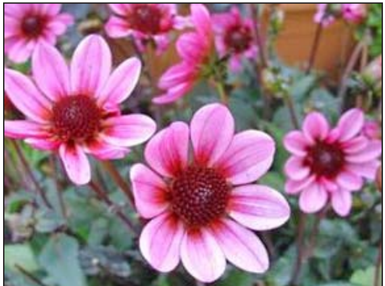
Dahlia Dark Angel 'Pretty Woman'

Senecio 'Blue Chalk Sticks' – An appropriately named succulent that is upright.