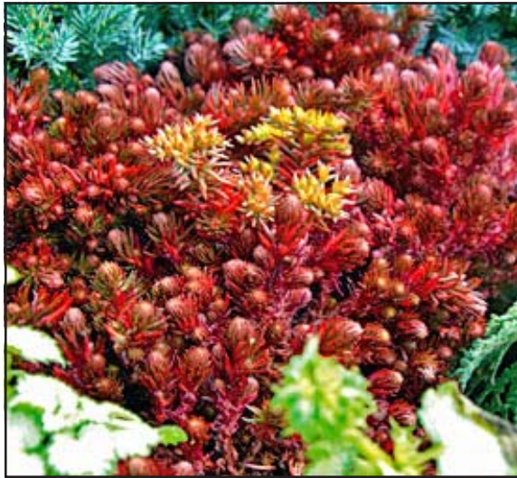
Sedum hakonense 'Chocolate Balls'

Dahlia Dark Angel 'Pretty Woman' – Single pink flowers on unique dark foliage.